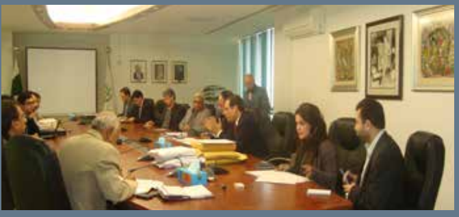
DTH consultant was held at PEMRA HQs on December 1, 2014 and short listing of the Consultants is in process.

PEMRA has initiated process for Direct-to-Home (DTH) licensing that would be awarded through open and transparent bidding. In this regard, an advertisement was published on October 30, 2014 for hiring of International Consultant to check the feasibility and requirement for granting license and launching DTH in Pakistani market. Bid opening ceremony for hiring of